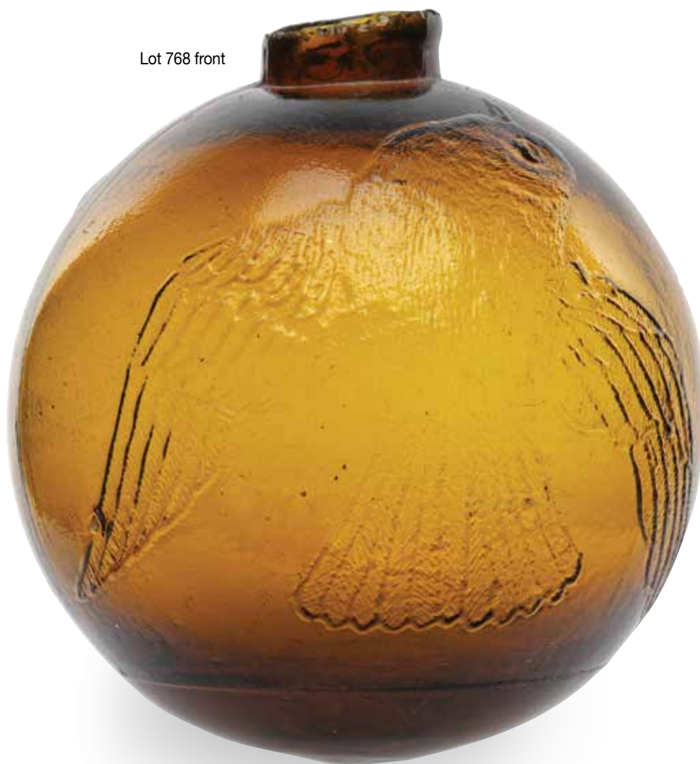
Lot 768 front