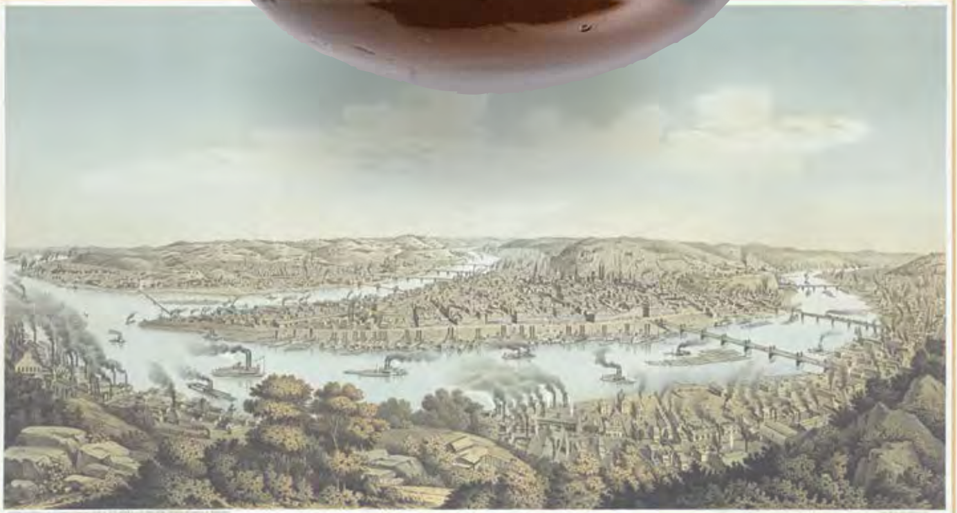
VIEW OF PITTSBURGH & ALLEGHENY.